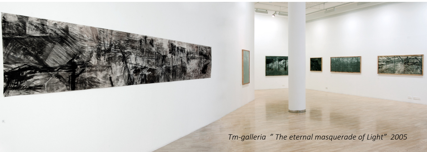
Tm-galleria "The eternal masquerade of Light" 2005