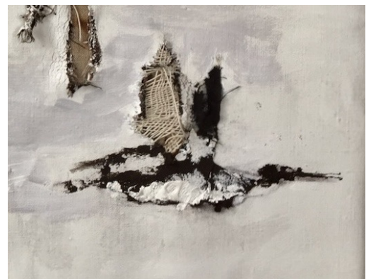
"Mergansers, my friends" määmi, gypsum, fishing yarn, 2019, detail

Finnish Painters' Union 2005– Helsinki Artists' Association 2004– Viipuri Artists' Association 2025– Seniorikuvataiteilijat [Senior visual Artists] ry. 2025– OFAAA Olympic Fine Arts Artists Association 2012– MOFAA Meadows of Olympic Fine Arts Artists 2014– The Finnish Association of Architects 1985–2000 Rakennustaiteen seura ry [Architectural Society] 1985– Tringa, BirdLife 2025–